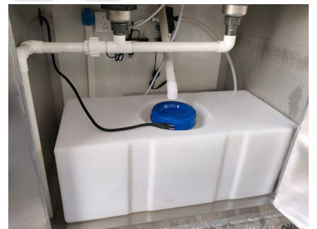
- Clean Water Tank -