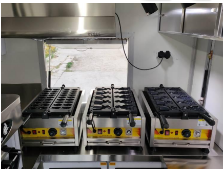
- Tayaki Makers -