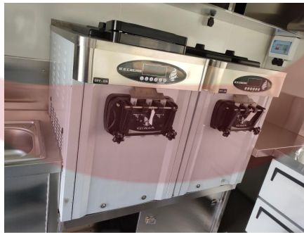
- Ice Cream Makers -