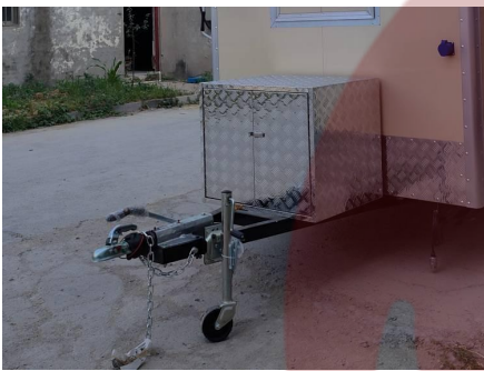
- Tow Bar -