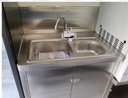
- Sinks -