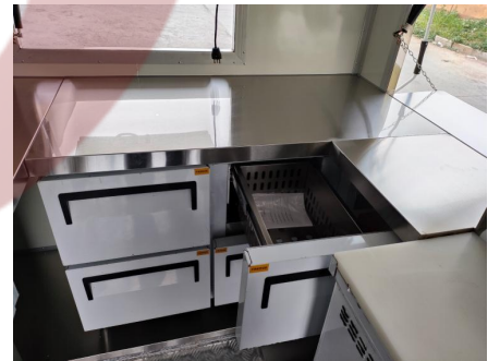
- Fridge -